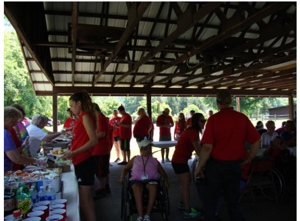
47 th year of the Pioneers volunteering at the Charleston Distance Run Pasta Party – cancelled.