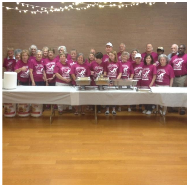
WV BHI - Race for the Cure – cancelled.